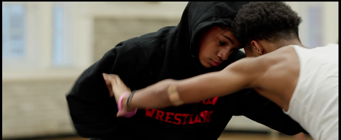
Current Student 2 (TBD)