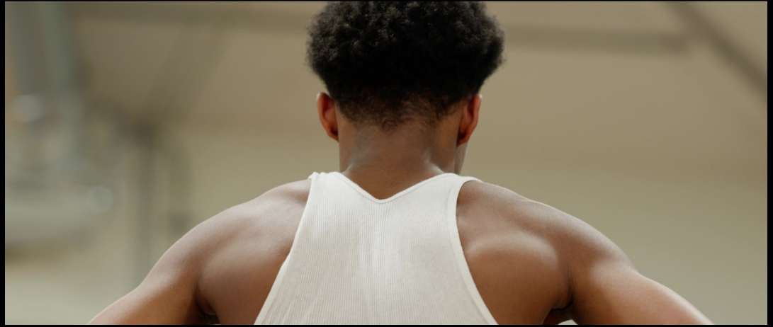
Current Student 1 (TBD)